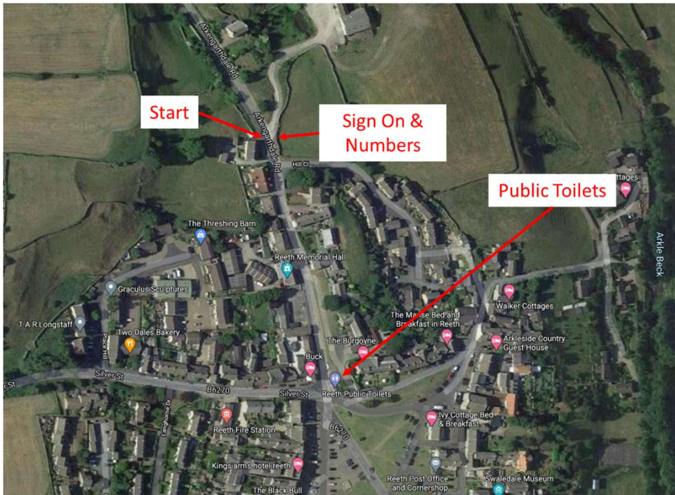
Location of Start & Sign On - Langthwaite Road from Reeth